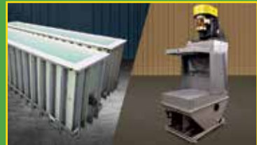
Custom fabricated metal finishing tanks, hoods and ductwork, ventilation