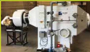
Scrubbers for every finishing requirement, including chrome, H2SO4, HCl, NH3, HNO3, NOx