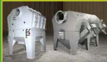
Whirl/Wet® dust collectors use minimal water, are 99%+ efficient over a wide micron range